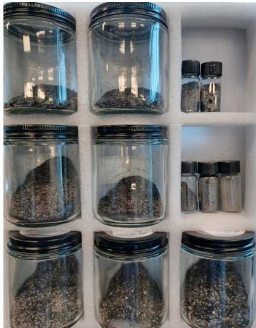
Figure 2: High-Quality Large and Jumbo Flake Graphite from Air-Classified VCT Process